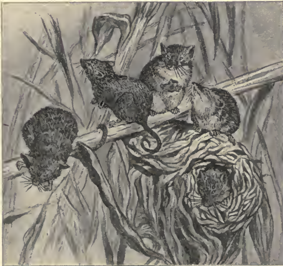
FIG. XXXII. RHITHRODONTOMYS MEGALOTIS. BIG-EARED HARVEST MOUSE.